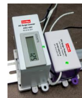
DUP with Surge Counter